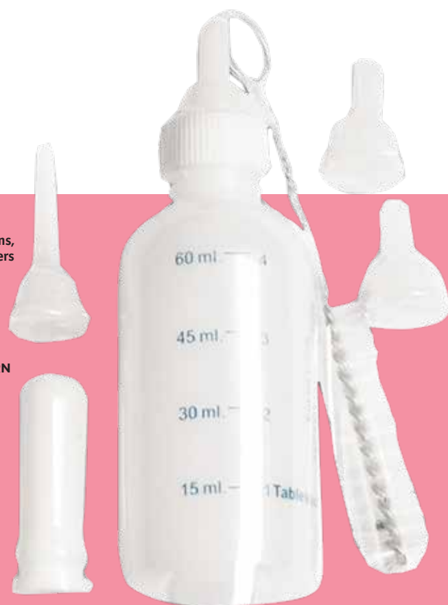
2 OZ (60 ML) NURSING BOTTLE KIT INCLUDES: 1 BOTTLE, 1 BOTTLE BRUSH, 5 NIPPLES